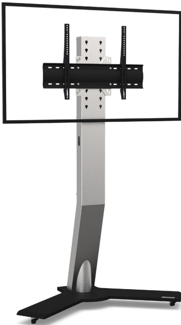
Screen simulation 55"

Part numbers : EKINOXS4060DS EKINOXS6570DS